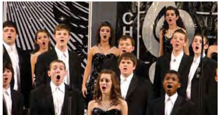
Summit Sound takes the stage!