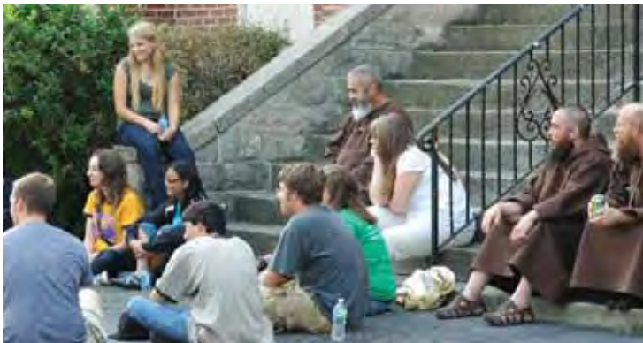
Student Retreat with the Franciscan Brothers Minor.